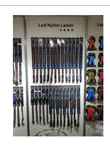
Dogness LED leashes on display at CES 2018